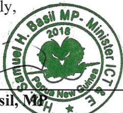
Hon. Sam Basil, MP Minister for Communication, Information Technology & Energy